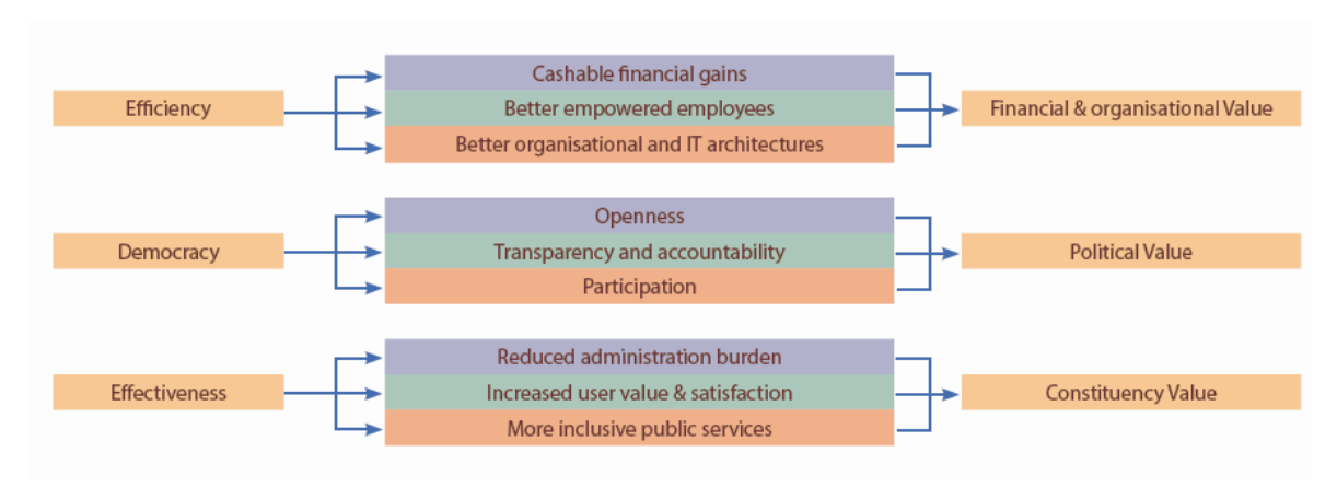
eGEP Measurement Framework Model (2006)