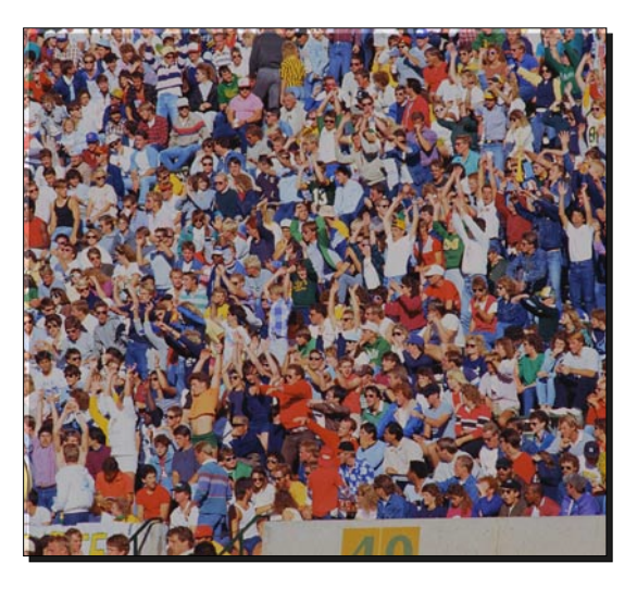
56.7 trillion trillion addresses per person