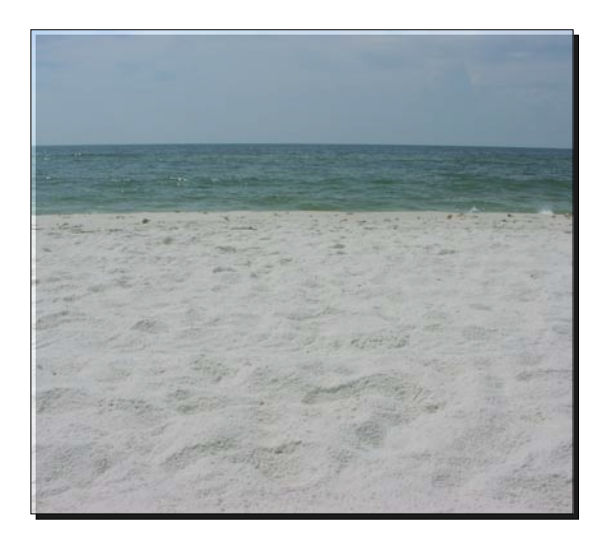
48 trillion addresses for <u>every</u> grain of sand, on <u>every</u> beach