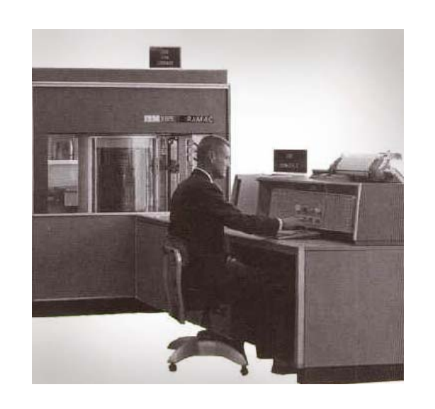
1956: 2005: 2025: 1 Megabyte = US$65,000* 700 Megabyte € to 2025: 2025: