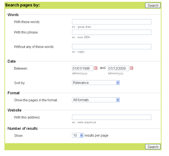
Figure 1: Search interface after full-text search.