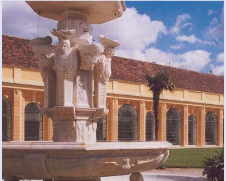
Orangerie Schönbrunn

The Schönbrunn Palace Orangery is an extraordinary place: while the building was originally conceived as a baroque greenhouse, the Habsburgs soon started using it as a venue for spectacular festivities and events. The Orangery looks back on a long and eventful past and was thoroughly renovated in the 1980s. Today, the Orangery combines the magic of times past with modern-day amenities. The ample floor-to-ceiling windows offer a fascinating view of the Orangery garden and flood your event with gorgeous natural light.