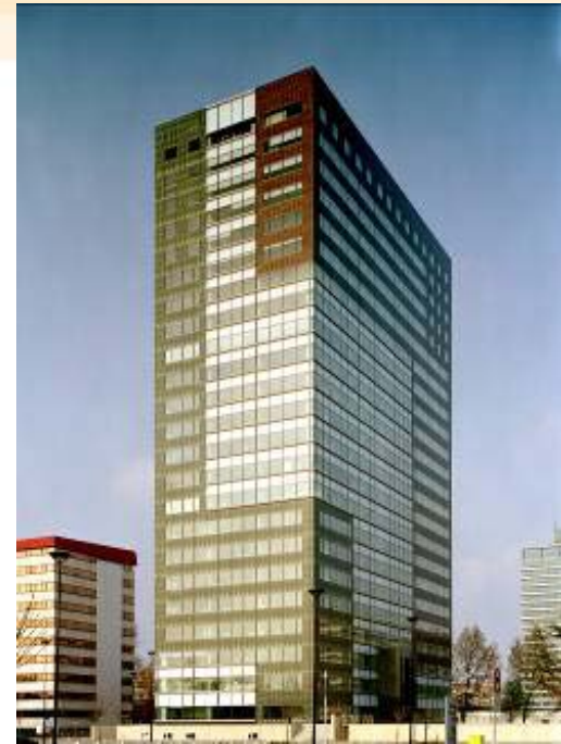
Winston Churchill Tower - Rijswijk: Renovation with a double skin facade (internally ventilated)

Budget: € 1 billion in 4 years In 2010: ~ € 130 million Euro