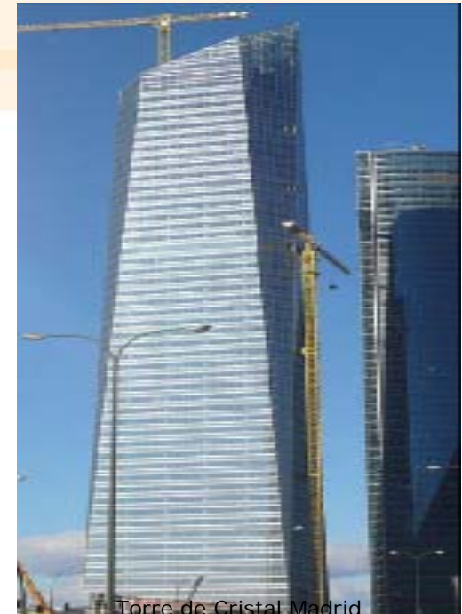
Torre de Cristal Madrid

Demonstration : Integration of innovative technologies