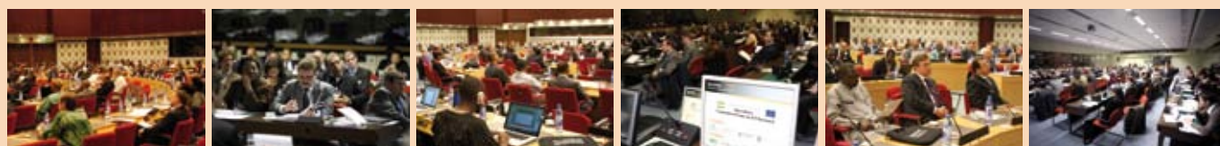
A Forum organised as a side-event to the 3rd Africa-EU Summit (Libya - Nov. 29-30, 2010) An event designed to anyone with an interest in Euro-African collaborative research on ICT