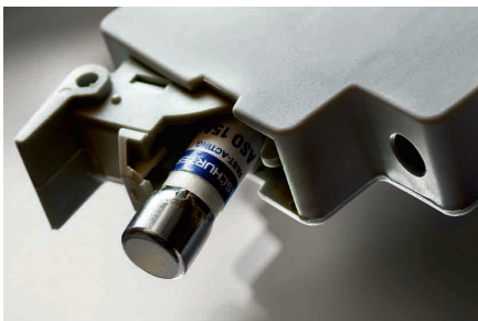
Fig. 2: ASO solarfuse and FSO fuseholder for PV systems

As industry standards are shifting and 1000 VDC protection is becoming more common, SCHURTER continues to develop fuses and fuseholders that meet this requirement at both high and low amperages. The quick-acting ASO line fuses (10 × 38 mm) 3 are UL-recognized. They are designed for DC applications of up to 1000 VDC and are capable of safely breaking nominal currents of up to 30 A, making them perfectly suitable for short circuit protection in the individual lines of PV systems. The FSO matching touch-proof fuseholder 3 is designed for DIN rail assembly and therefore perfectly suitable for use in junction boxes.