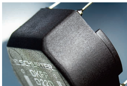
Fig. 4: DKFP current-compensated choke

Linear chokes 10 such as DLF are used for smoothing out output voltage fluctuations in step-up/down transformers, while current-compensated chokes such as DKFP are used for attenuating electromagnetic interference in auxiliary power supplies.