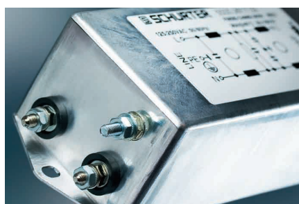
Fig. 5: FMBB NEO filter for one phase systems are characterized by a high symmetrical and asymmetrical attenuation.

The DC voltage generated by PV systems is converted to standardized AC line voltage using frequency inverters or solar inverters which re-assemble the maximum solar energy supplied at the correct line frequency (50 or 60 Hz) and amplitude (250 or 380 VAC). The conversion process, however, causes interference which makes it more difficult to comply with the line quality as specified by the law. This is where SCHURTER individual components or entire AC filters FMAC ECO, FMAD, FMBC NEO, FMBD NEO 12 prove remedial. For off-grid systems, sinusoidal filters are also suitable.