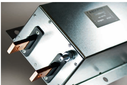
Fig. 3: FMER SOL filters are designed for rated currents from 25 A to 1500 A at 55°C ambient temperature, and voltages up to 1200 VDC.

The DC filter FMER SOL 8 reduces electromagnetic interference towards the solar panel to a minimum, thereby considerably increasing installation life span and safety. The type FMER SOL filters are suitable for voltages up to 1200 VDC at nominal currents of between 25 A and 1500 A, i.e. for small off-grid systems as well as for power plants of up to 500 kVA.