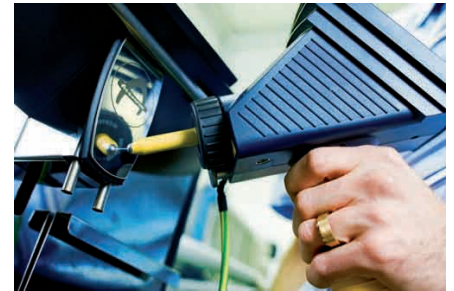
Fig. 6: ESD immunity testing

SCHURTER will perform all necessary preliminary tests concerning immunity and interference in the photovoltaic system or equipment. Our EMC competence center is equipped with all the measurement tools necessary and an EMC chamber for measuring line-bound interference.