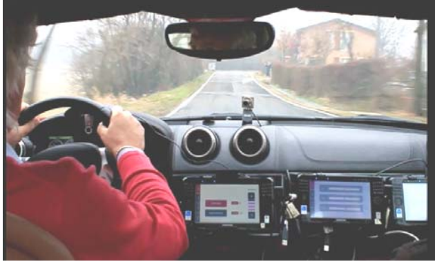
© Reflect project - Vehicle as a co-driver prototype

A vehicular setting contains sensor devices for physiological and performance monitoring and actuator devices that can influence the driving process. Four bio-cybernetic loops are capturing emotional, cognitive, physical and behavioural aspects of the driver's state. Each loop has been separately evaluated and assessed in a simulating environment and then deployed in the vehicular demonstrator.