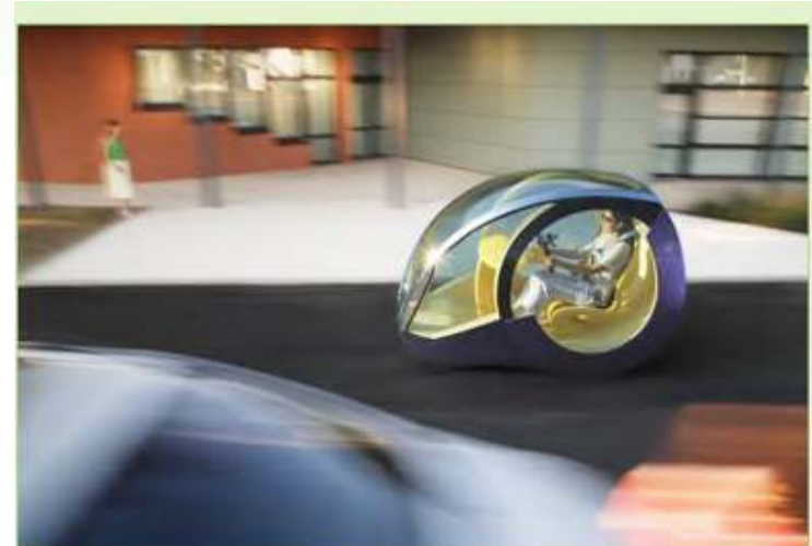
MOOVIE, PEUGEOT DESIGN COMPETITION WINNER