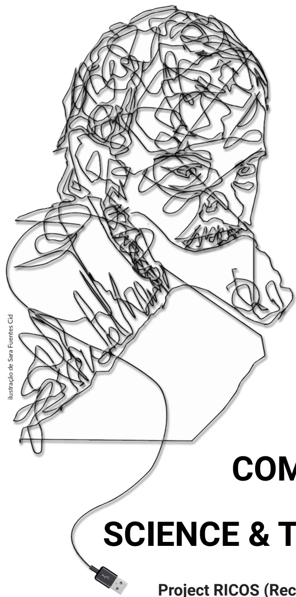
Ilustração de Sara Fuentes Cid